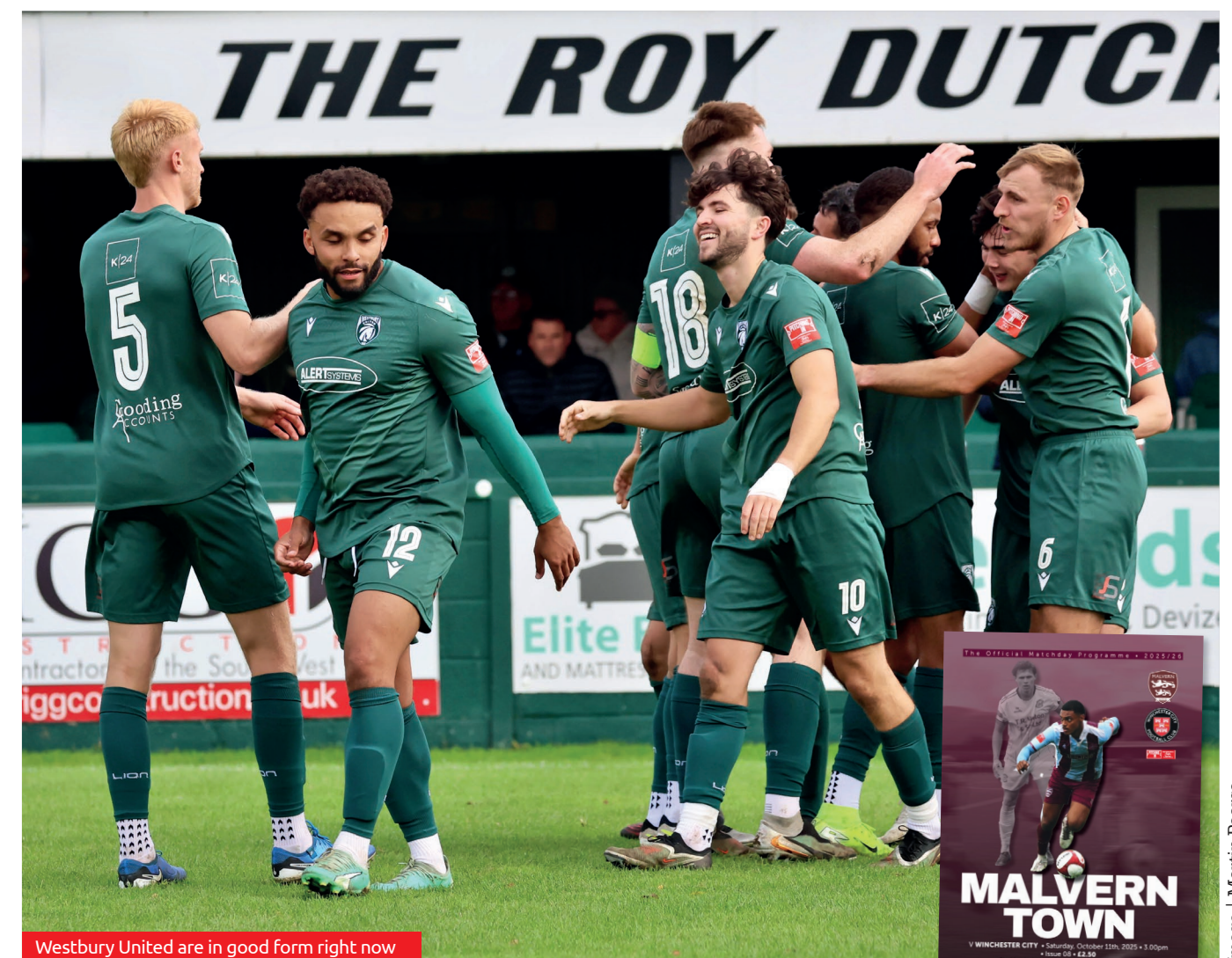
Westbury United are in good form right now