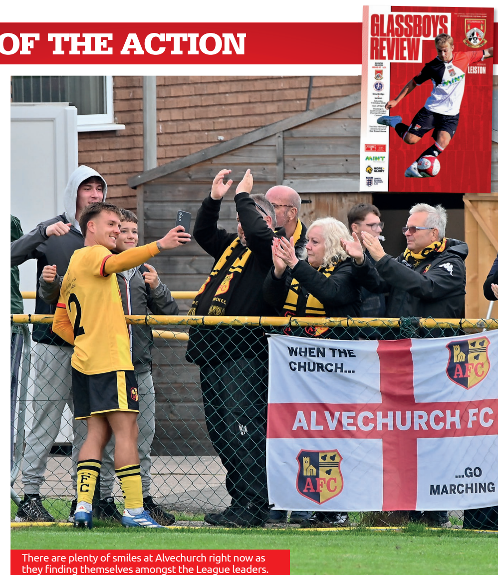
There are plenty of smiles at Alvechurch right now as they find themselves amongst the League leaders.

Looking to make home advantage count are Royston Town as they battle it out with Halesowen Town, whilst Stourbridge find themselves on home soil for the first time in almost a month as they entertain Leiston and AFC Sudbury head to Stratford Town.