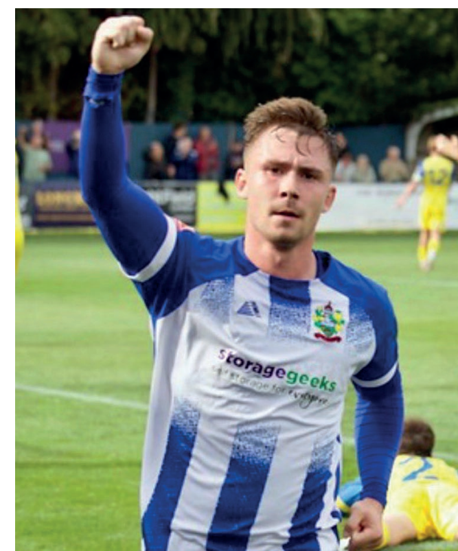
With a new manager at the helm, Chertsey Town will be hoping to start on the right foot at the weekend

The remaining action sees Uxbridge host Basingstoke Town and two new-boys, Yate Town and Berkhamsted, battle it out.