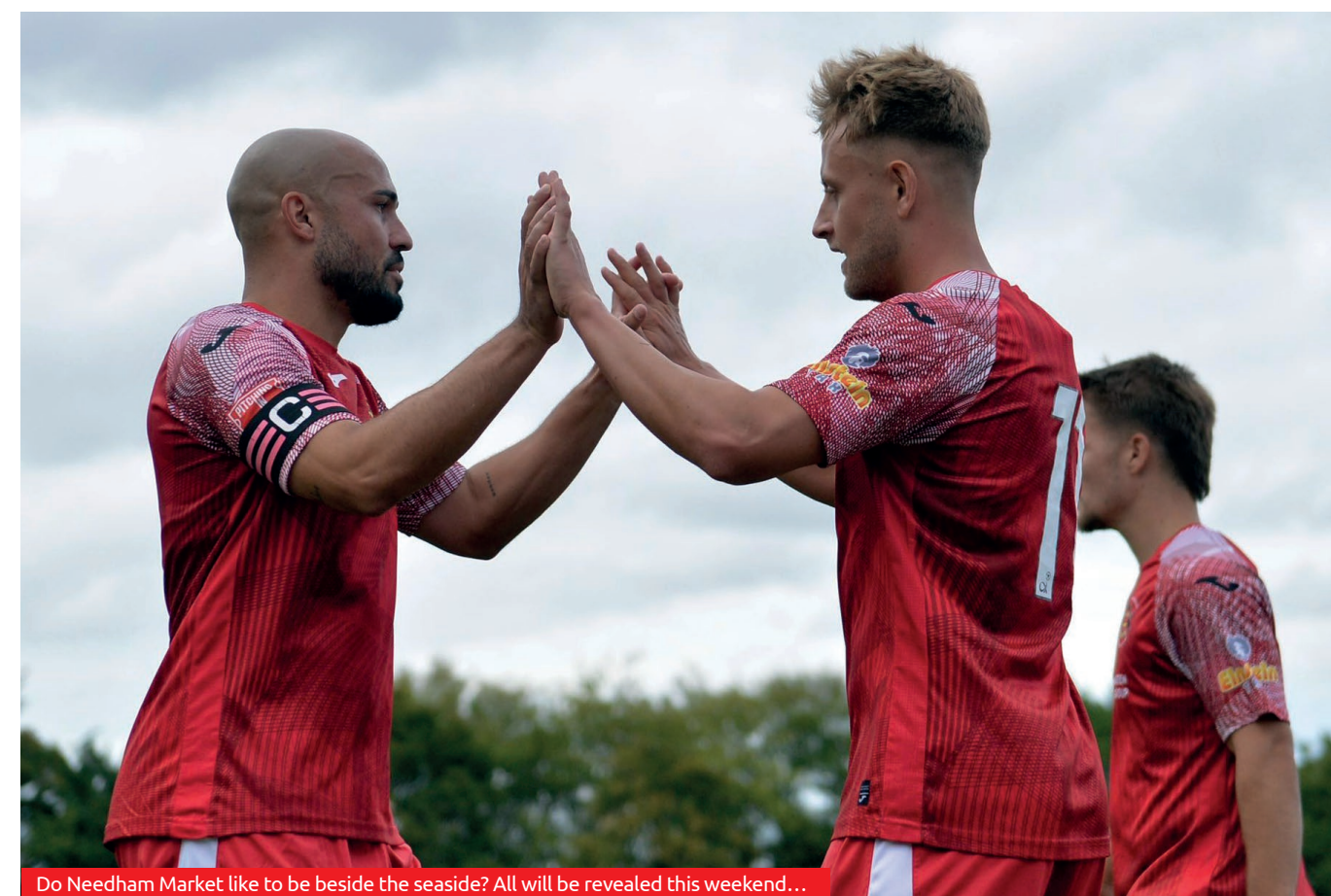
Do Needham Market like to be beside the seaside? All will be revealed this weekend...

There are a total of seven ties involving our member clubs as they look to make it into the first round proper of the Emirates FA Cup.